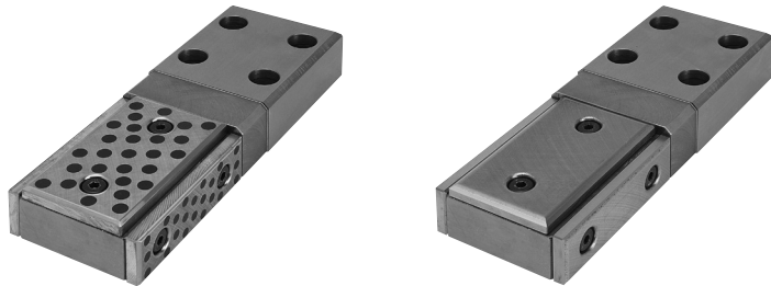
GBTX(Sintered Plate Type)